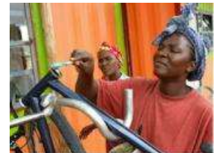
Repairing bicycles in Rundu, Namibia.